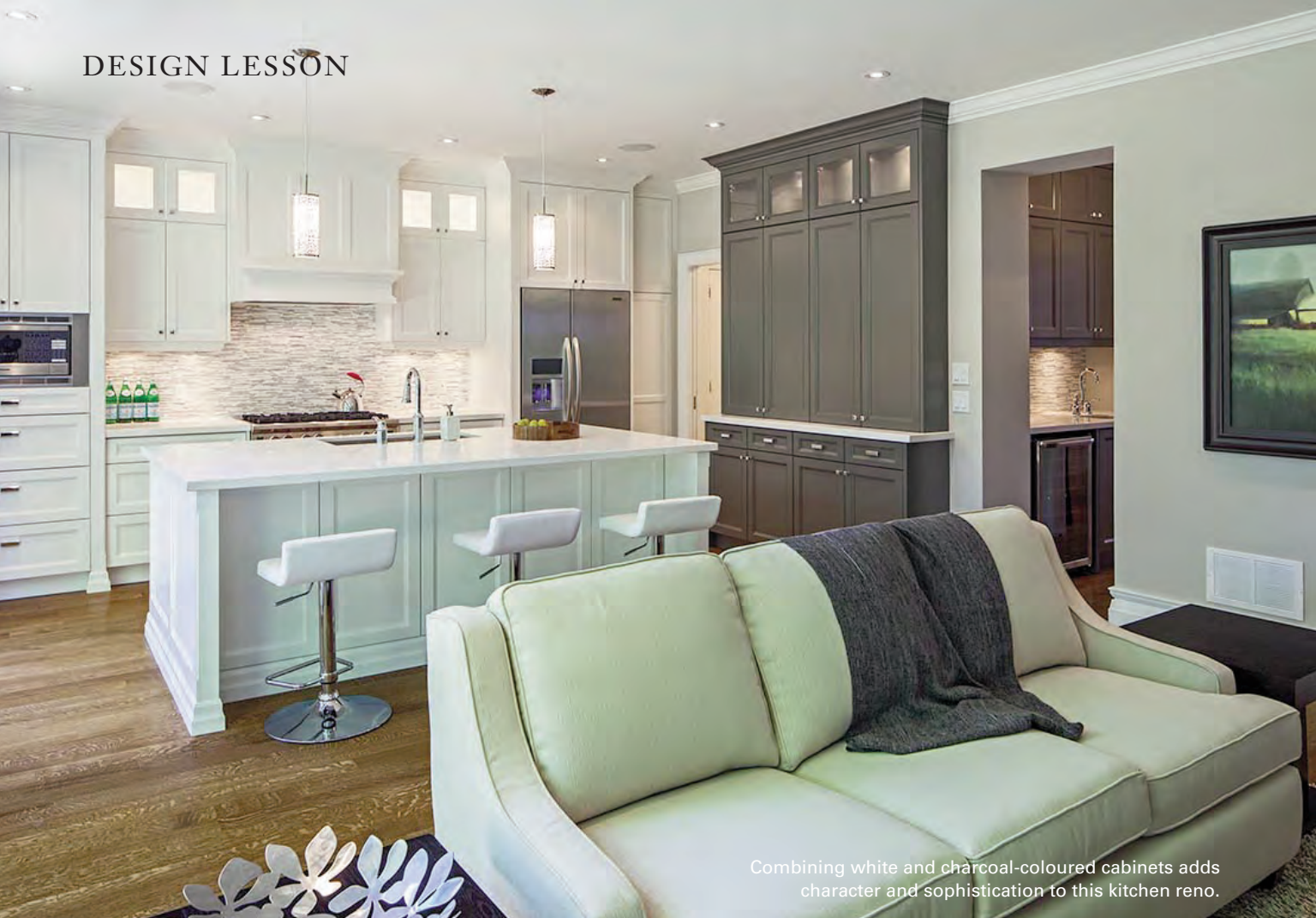
Combining white and charcoal-coloured cabinets adds character and sophistication to this kitchen reno.