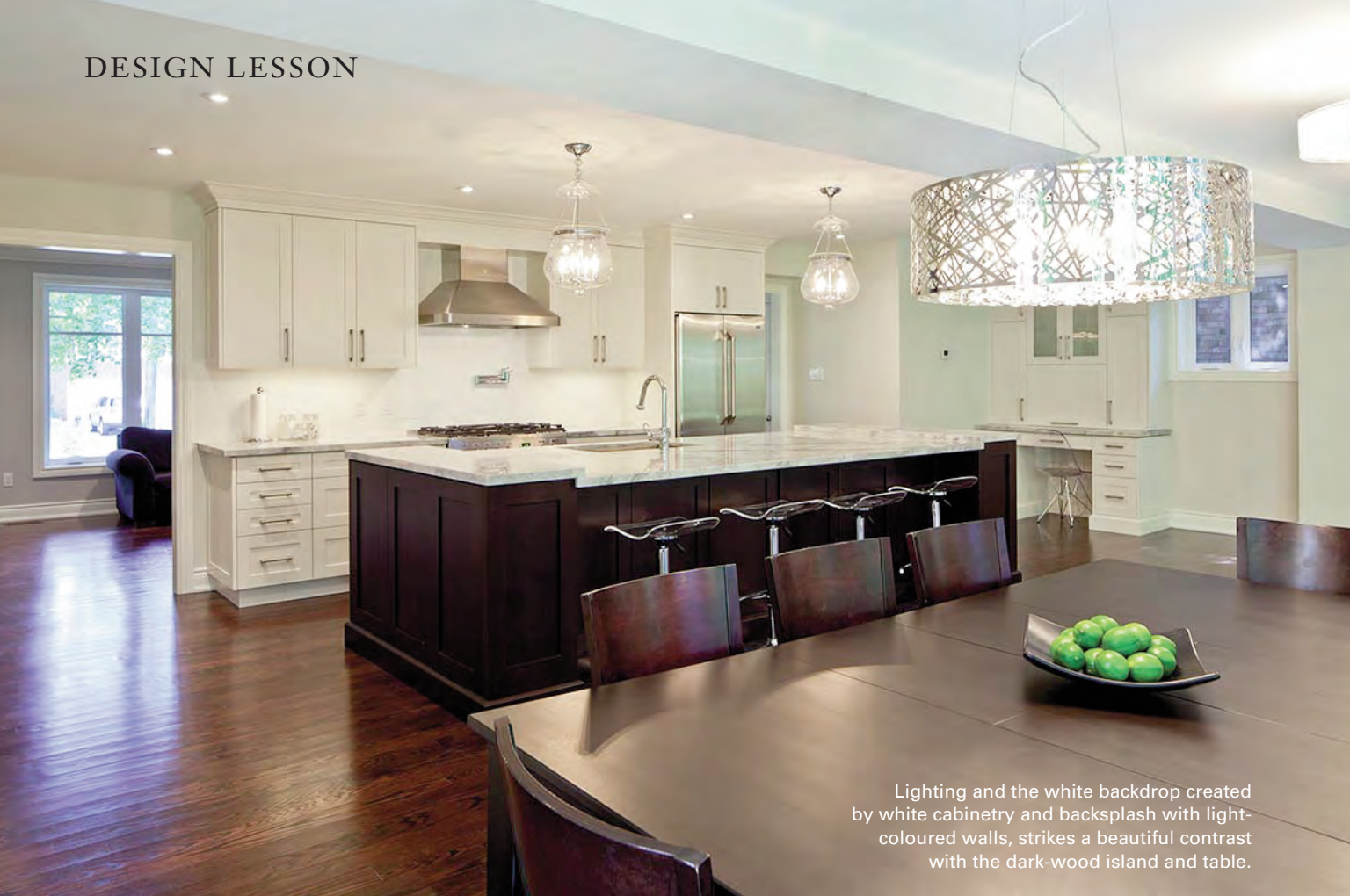
Lighting and the white backdrop created by white cabinetry and backsplash with light-coloured walls, strikes a beautiful contrast with the dark-wood island and table.

Jimmy Zoras Owner @ Distinctive by Design Fine Cabinetry