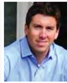
By Brendan Charters

EXPERTS DISH OUT ON THE LATEST IN KITCHEN UPGRADES